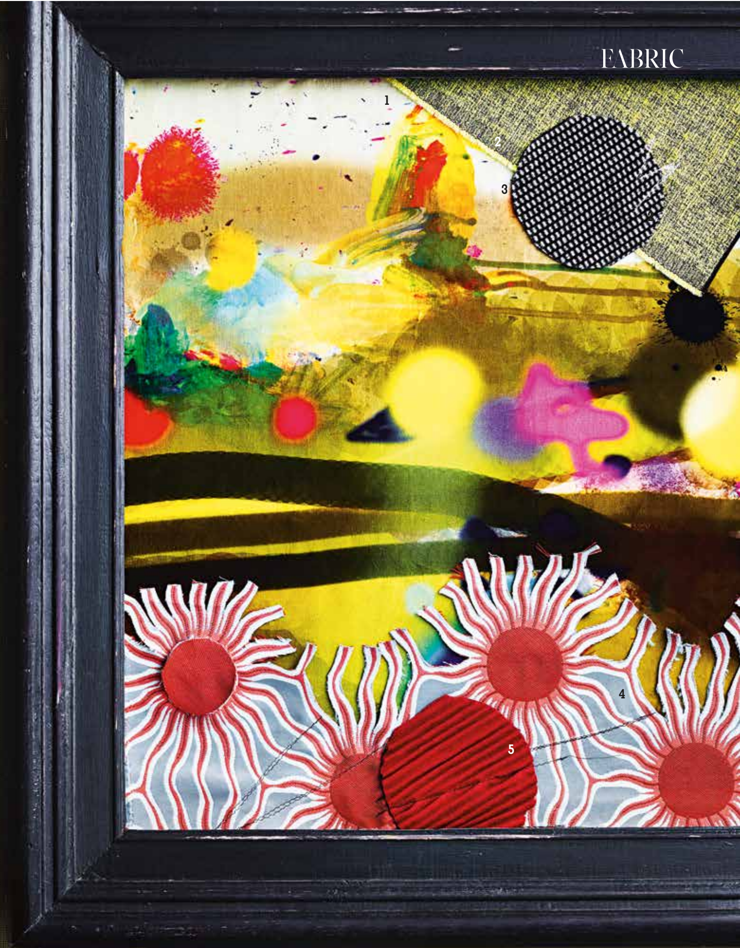
IN FRAME, FROM TOP: 1. Timorous Beasties 'Graffiti Stripe' in Original (as background); enquiries to South Pacific Fabrics. 2. Designers Guild 'Trevellas' in Lemongrass; enquiries to Radford. 3. Jim Thompson 'Khao Yai' in Black; enquiries to Milgate. 4. Catherine Martin Paradiso 'Helios' in Red Coral (sun fabric); enquiries to Mokum. 5. Weitzner 'Channels' in Crimson; enquiries to South Pacific Fabrics. 6. Christopher Farr Cloth 'Alto' in Lemon (as background); enquiries to Ascraft. Painted 19th-century French frame, $480; Kontor 255. Details, last pages.