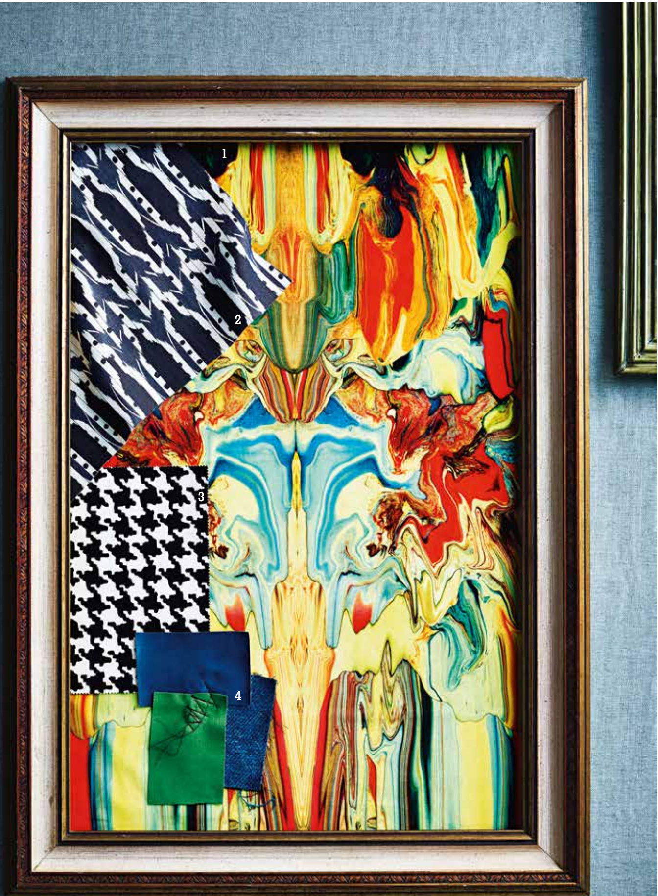
IN FRAME, FROM TOP: 1. Timorous Beasties 'Marble Gun' in Original (as background); enquiries to South Pacific Fabrics. 2. 'Nias' in Bleu; enquiries to Unique Fabrics . 3. Alcantara 'Roma 1001' in Black Print; enquiries to South Pacific Fabrics. 4. 'Global Suede' in Kingfisher, 'Cumulus' in Lime and 'Dino' in Kingfisher; all enquiries to Warwick . Bistro mirror with moulded brass frame (top right), $1100; Kontor 255. Vintage frame (bottom left), POA; ACME Framing. 5. Jim Thompson 'Shaker Chic' in Moonstone (as background); enquiries to Milgate. Vintage frame, POA; ACME Framing.